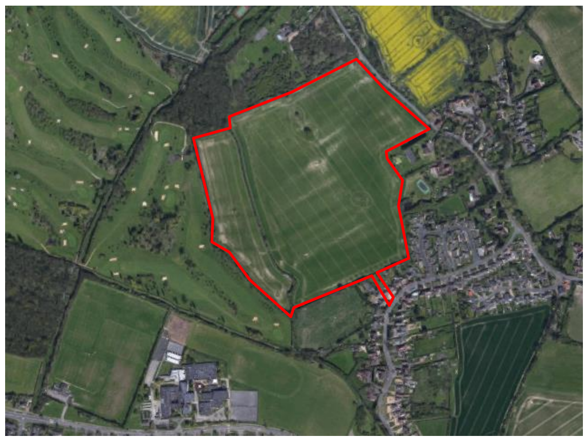
Plan 1: Location of Application site

2.3 Beyond the boundaries of the site, to the immediate east and south east, lies the developed area of Salph